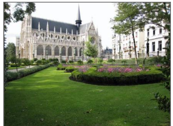
The beautiful church Notre Dame du Sablon, Brussels

Place du grand Sablon 41 1000 BRUXELLES T: +32 (0)2513 14 66