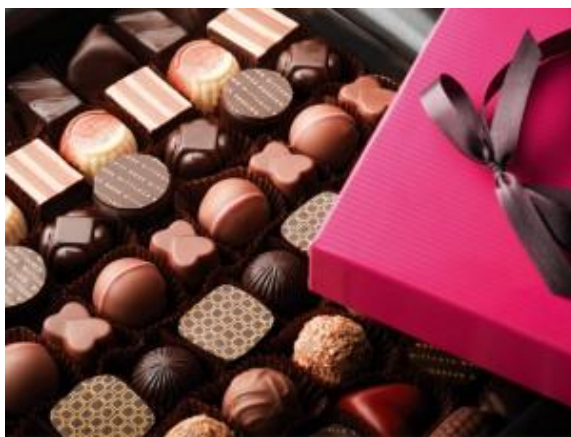
Wittamer chocolates, epitome of elegance

Brussels' chocolate Mecca is the Grand Sablon (Grote Zavel in Dutch), the small square (a triangle actually) with the beautiful Notre Dame du Sablon church at its head, right opposite the hotel for the Pack2Go Europe autumn conference 2010. Lining the streets are cafes, bars, restaurants and shops – most notably the best selection of chocolate shops in Brussels.